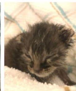
This kitten is thin, wet, and cold, and has discharge from the eyes.