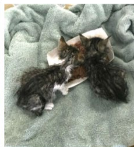
These kittens are thin, wet, and cold. You can see their backbones.