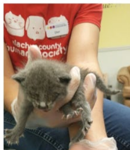
This kitten is noisy, dirty, and sick. It has nasal discharge and crusted-shut eyes.