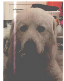
Everest & Family