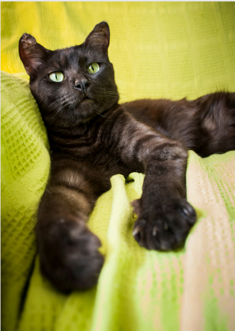
*Name has been changed.